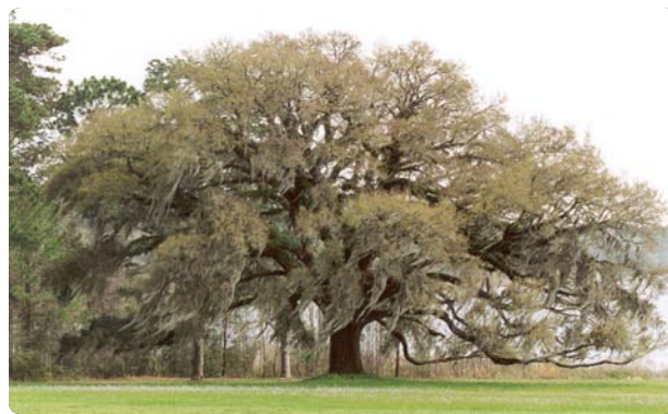
This is Angel Oak, Charleston, SC. ( http://www.angeloaktree.org/history.htm ) 17,000 sq. ft. of shade!